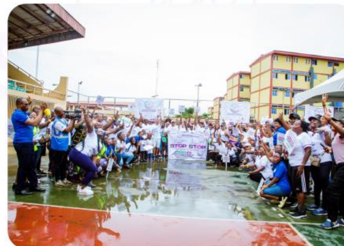
A group photograph of all attendees at the 2nd edition of the #Move4PD awareness walk. (May).