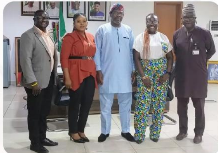
We signed a memorandum of Understanding (MOU) with the esteemed Nigerian Institute of Medical Research (NIMR). (January).