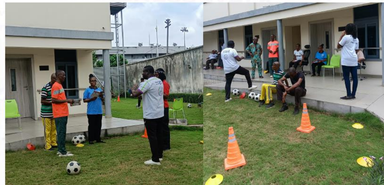
Warriors engaging in a Walking Football block session ahead of the Walking Football Tournament (October).