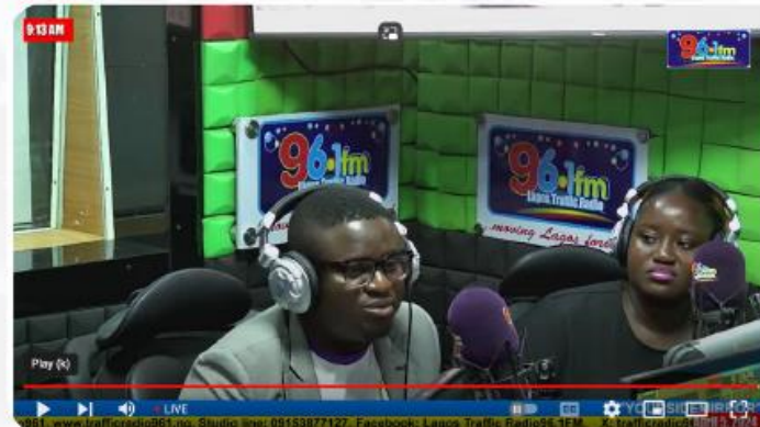
We premiered our first documentary featuring 3 members of ADPF sharing their experience with Parkinson's Disease. (JUNE).