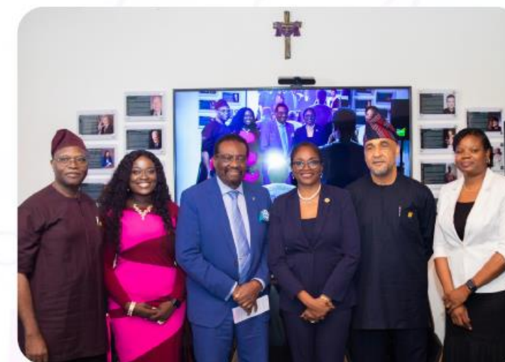
Guests at the 2nd edition of the Parkinson's Disease Symposium themed "Educating, Engaging and Empathizing: Building a Supportive Ecosystem for Parkinson's Awareness and Care". (April).