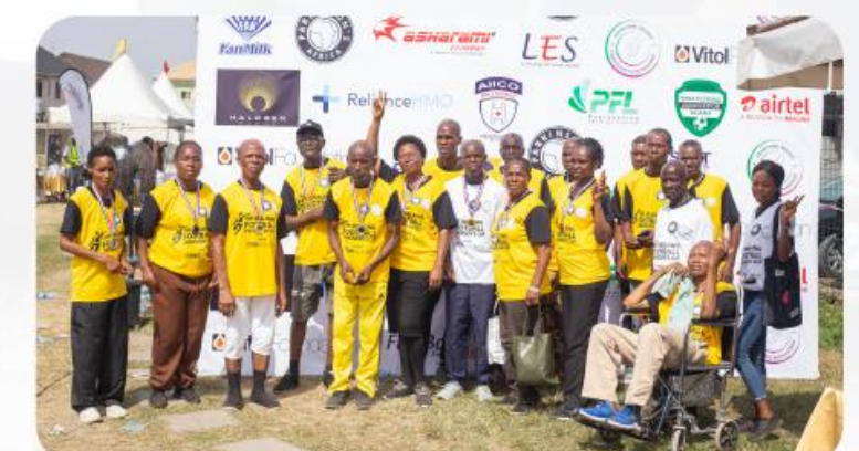
ADPF members at the 2nd edition of the Walking Football for Parkinson's Disease Tournament held in partnership with Parkinson's Africa. (November).