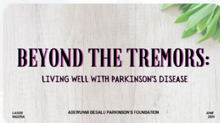
We premiered our first documentary featuring 3 members of ADPF sharing their experience with Parkinson's Disease. (June).